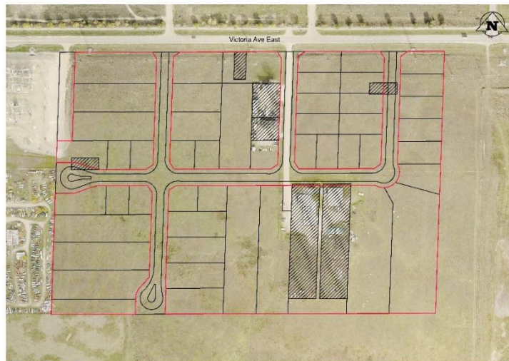
Victoria East Industrial Subdivision Concept